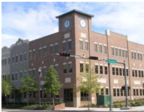
Renaissance Center, 435 N. Maccomb St.

The move follows that of the Leon County Growth and Environmental Management Department, which moved to the Renaissance Building in March 2007. The City of Tallahassee's Growth Management Department will also move to the Renaissance Building by the end of the year. Locating the three departments in the same location was a decision made by the City and County Commissions with the intention of improving services to customers by having all City/County zoning, permitting and development processes available at one location.